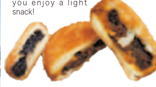
The super-popular curry bread (right) and sweet red bean paste donut (left).

With a panoramic view of the ski slopes and the Ishikari Plain from the big windows, the location doesn't get much better than this. Warm up in front of the big wood fireplace as you enjoy a light snack!